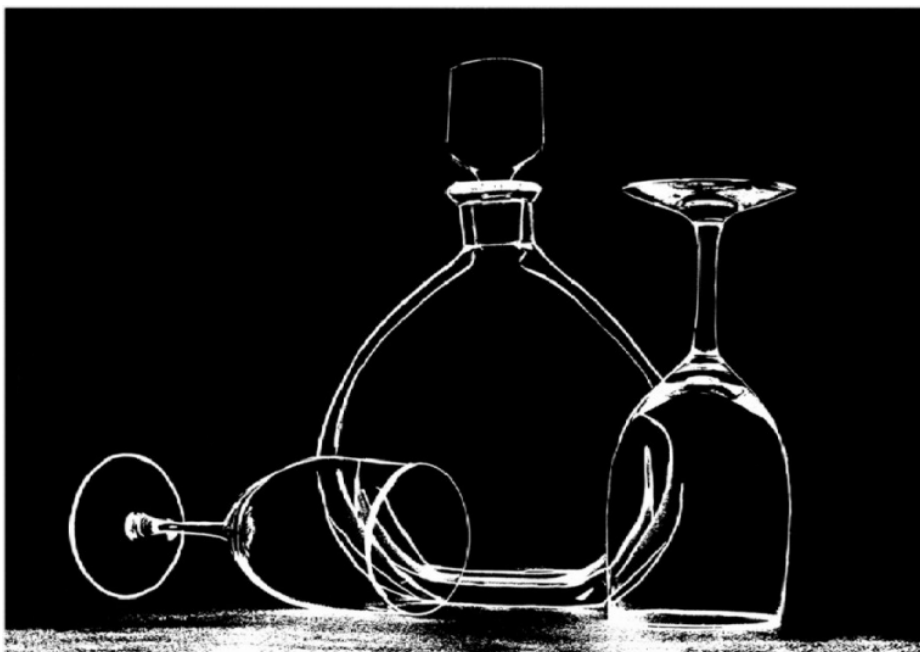
Black Glass by Gene Schwope.

Will the Saint Paul Camera Club continue for another 125 years? The interest in photography continues to explode. People love to take and be in pictures. Billions of photographs are taken each day with the ubiquitous smartphones. Just as there have been revolutionary changes in photography since the Club's founding in 1893, there will undoubtedly be many changes in the years ahead. If the Club can continue to adapt to whatever changes occur and help its members