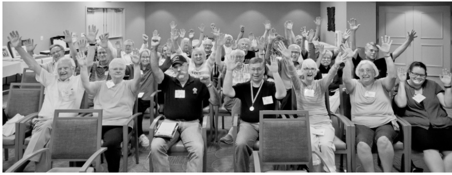
Club members in a joyful mood.

thing you want to look at—something that captures your attention? Does it tell a story?