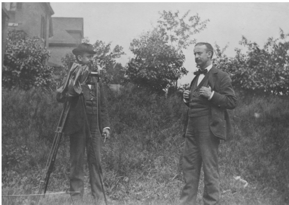
Two unidentified members of the St. Paul Camera Club standing in a yard or garden about 1898. Note the camera is mounted on a tripod and the photographer is holding in his left hand a cable that controls the shutter.

Membership in the Club for the past 125 years has had peaks and valleys and there may even have been years when meetings were not held. The Club's records are not complete, but the Club's centennial history reports that it was incorporated in 1899. 2 Nevertheless, the lineage of today's Club can be traced to that initial organizational meeting in March 1893. With a heritage of 125 years, the Club is the oldest camera club in Minnesota and the fourth oldest in the United States. That