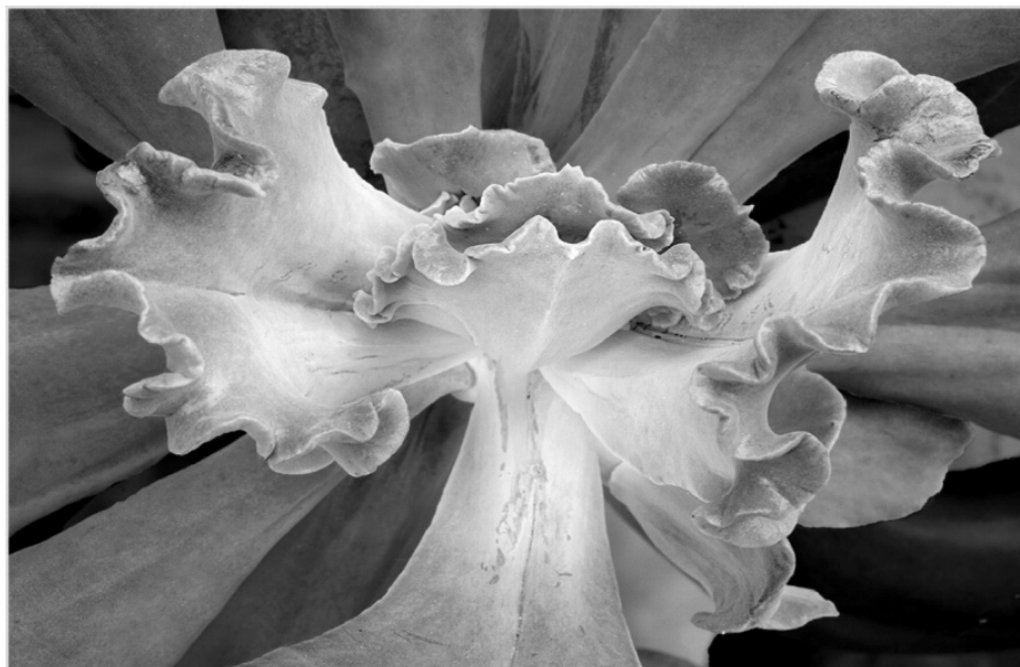
Succulent in San Antonio by Peggy Boike.

to both take and make photographs they judge to be “great,” then the Club may well be able to celebrate its 250th anniversary in 2143.