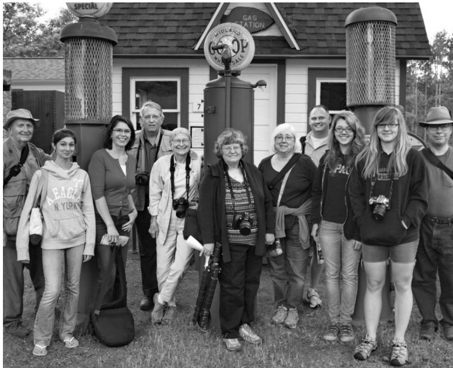
Club members on an outing.